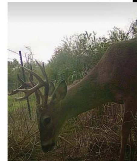
WILDLIFE ON PROPERTY