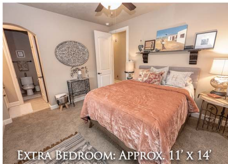
EXTRA BEDROOM: APPROX. 11' X 14'