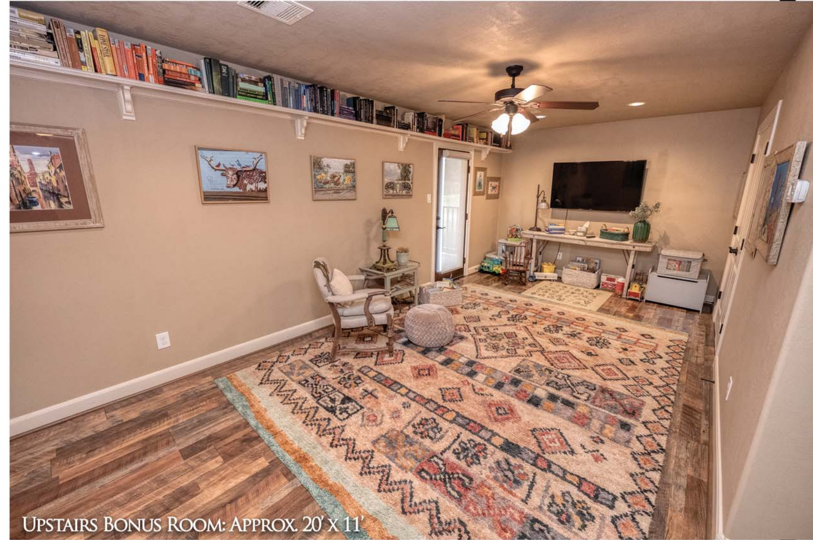
UPSTAIRS BONUS ROOM: APPROX. 20' X 11'