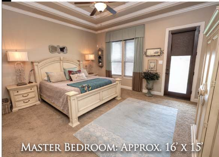
MASTER BEDROOM: APPROX. 16' X 15'