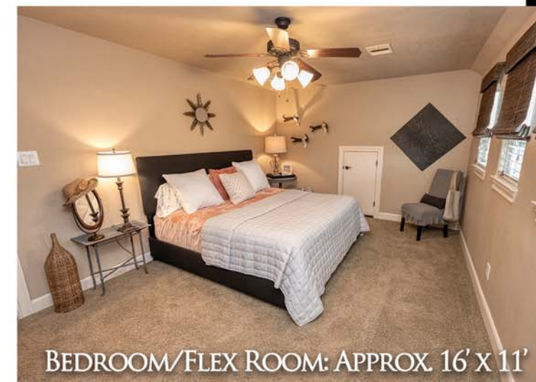
BEDROOM/FLEX ROOM: APPROX. 16' X 11'