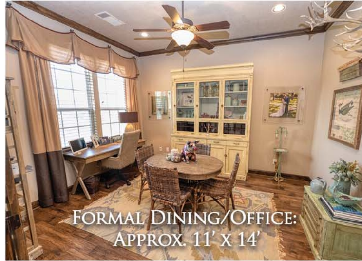
FORMAL DINING/OFFICE: APPROX. 11' X 14'