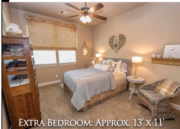
EXTRA BEDROOM: APPROX. 13' X 11'