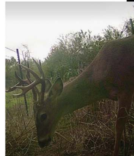
WILDLIFE ON PROPERTY